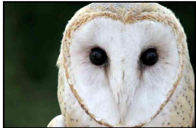
ok, who are you? Have you been to the Cincinnati Zoo.