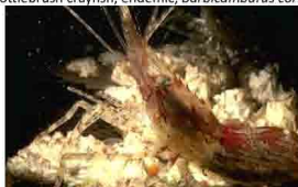
Kentucky Cave Shrimp, endemic, E, Palaemonias ganteri