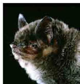
Gray Bat, E, Myotis grisescens