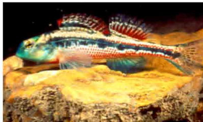
Splendid Darter, endemic, Etheostoma barrense