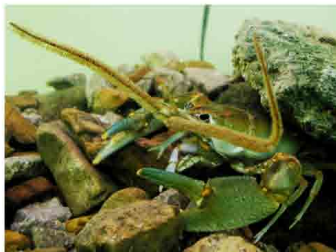
Bottlebrush crayfish, endemic, Barbicambarus cornutus