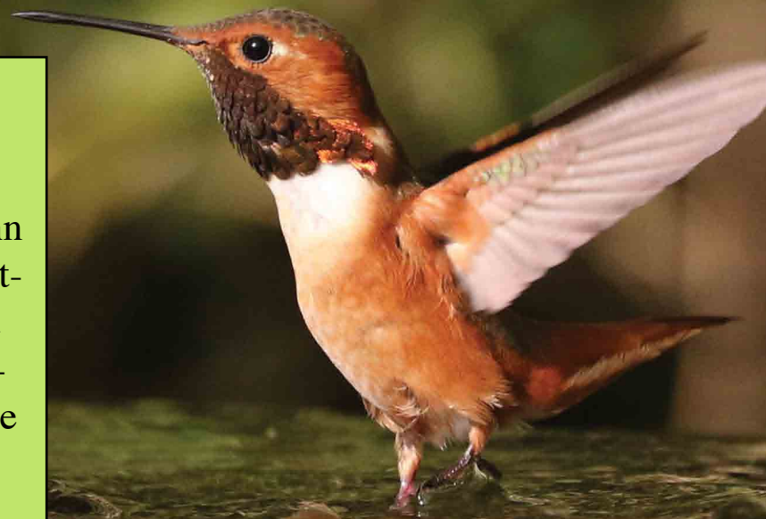
Allen's Hummingbird

DCAS field trip to the wetlands boardwalk of the John James Audubon State Park wetlands: We will meet Feb 18, at 8 a.m., at the backlot of moonlite BBQ, to then carpool to the state park.