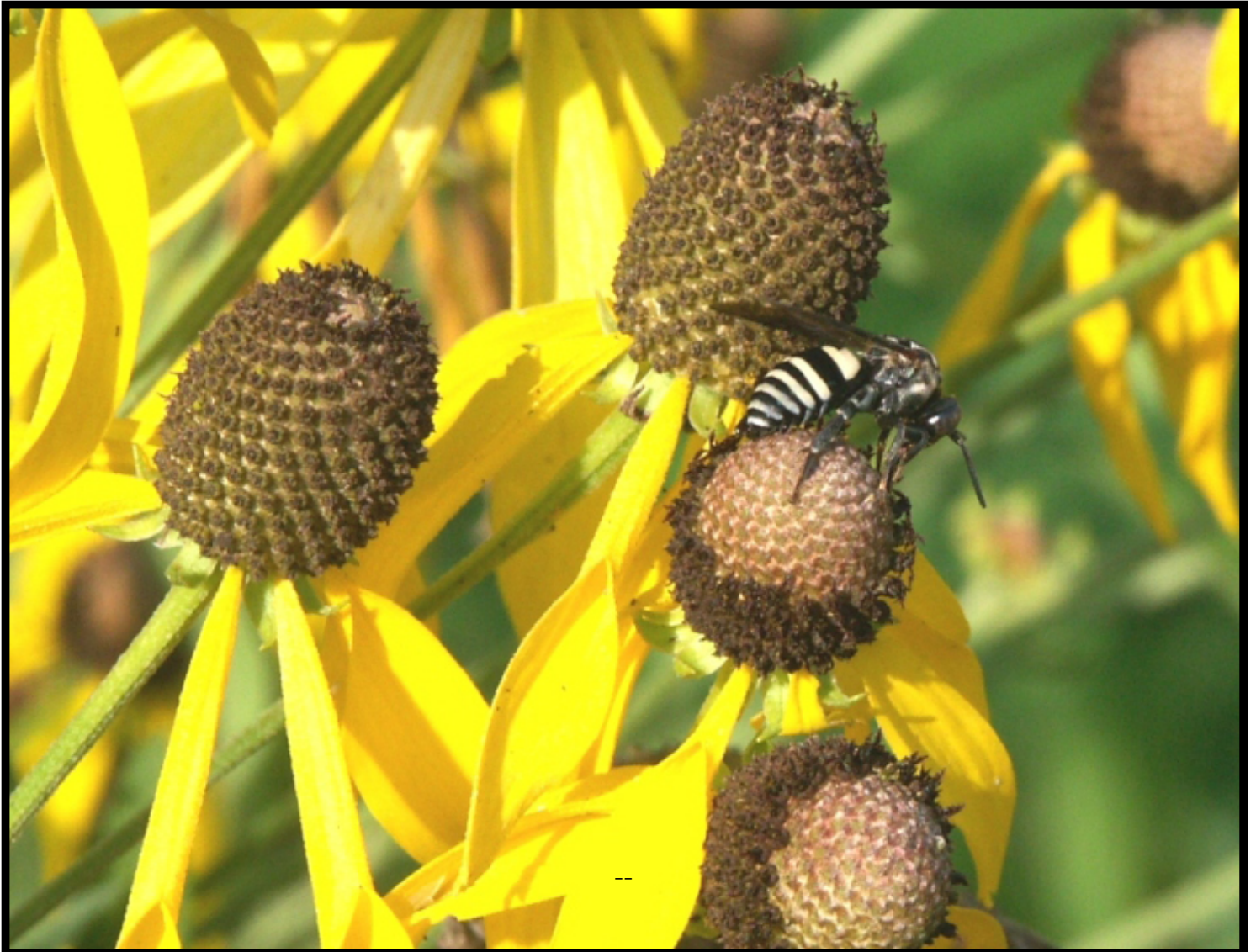
This feels warmer just looking at it.