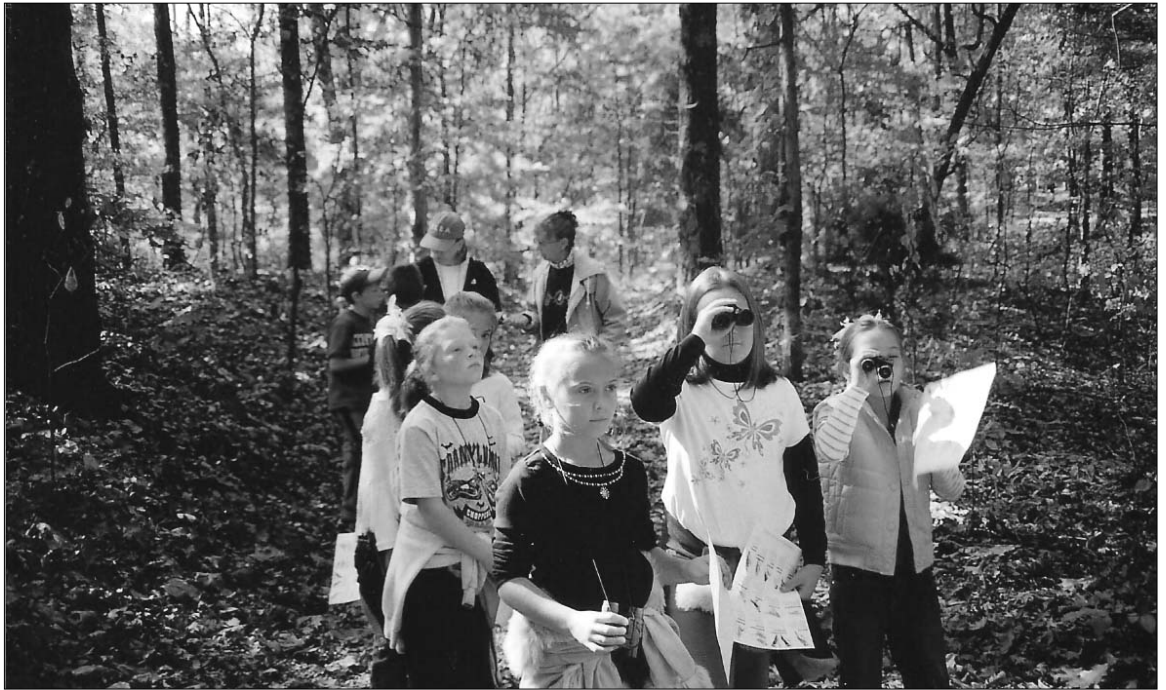
Sorgho Elementary students look for birds on a hike.